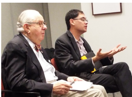
Representatives from the District of Columbia Dental Society share concerns with board regarding the processing of applications.